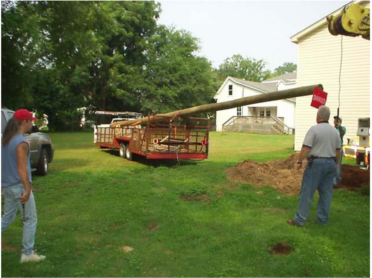
Next, the pole trailer was maneuvered into position.