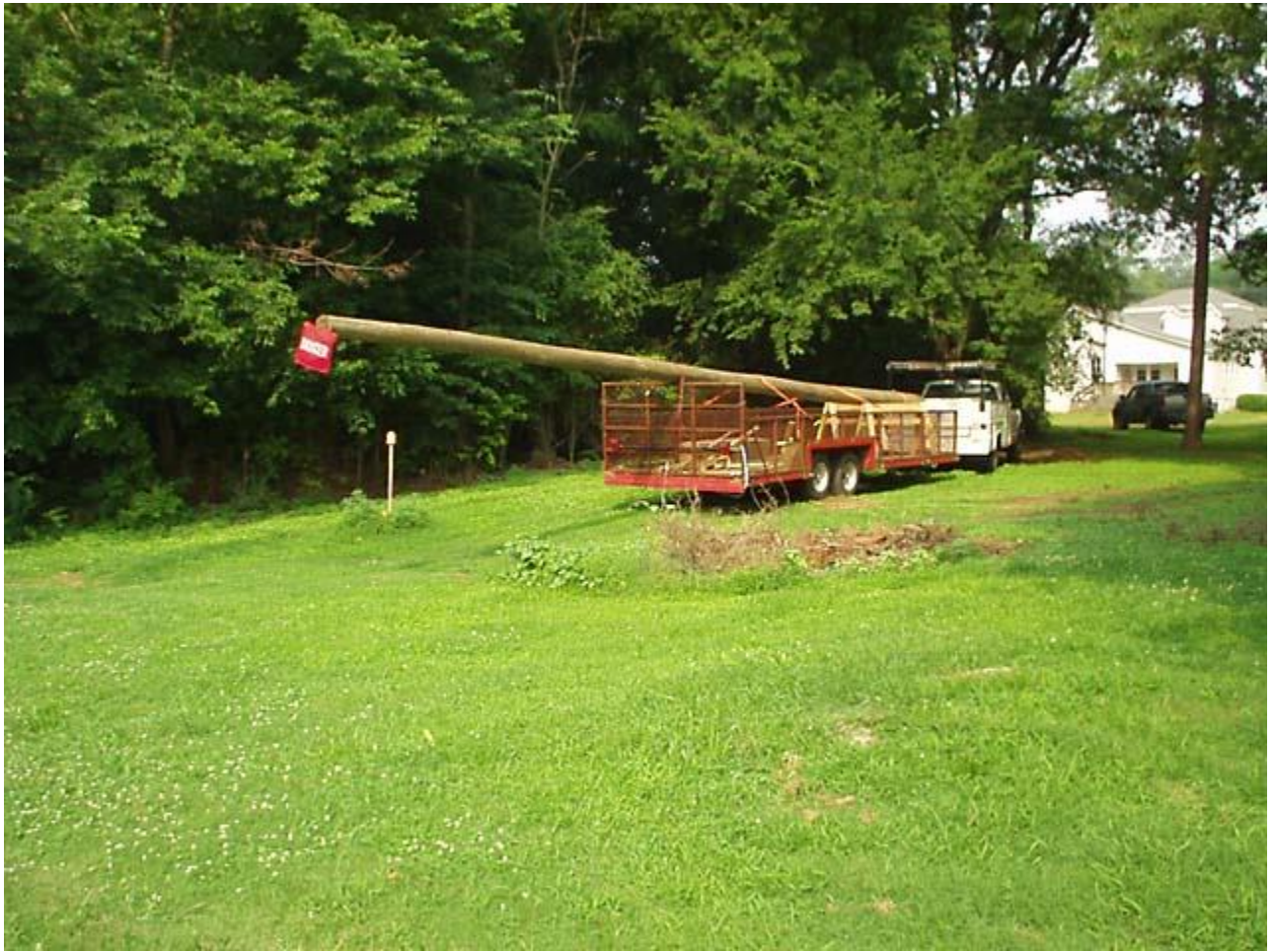
Several large trees had to be removed to make room for the pole.