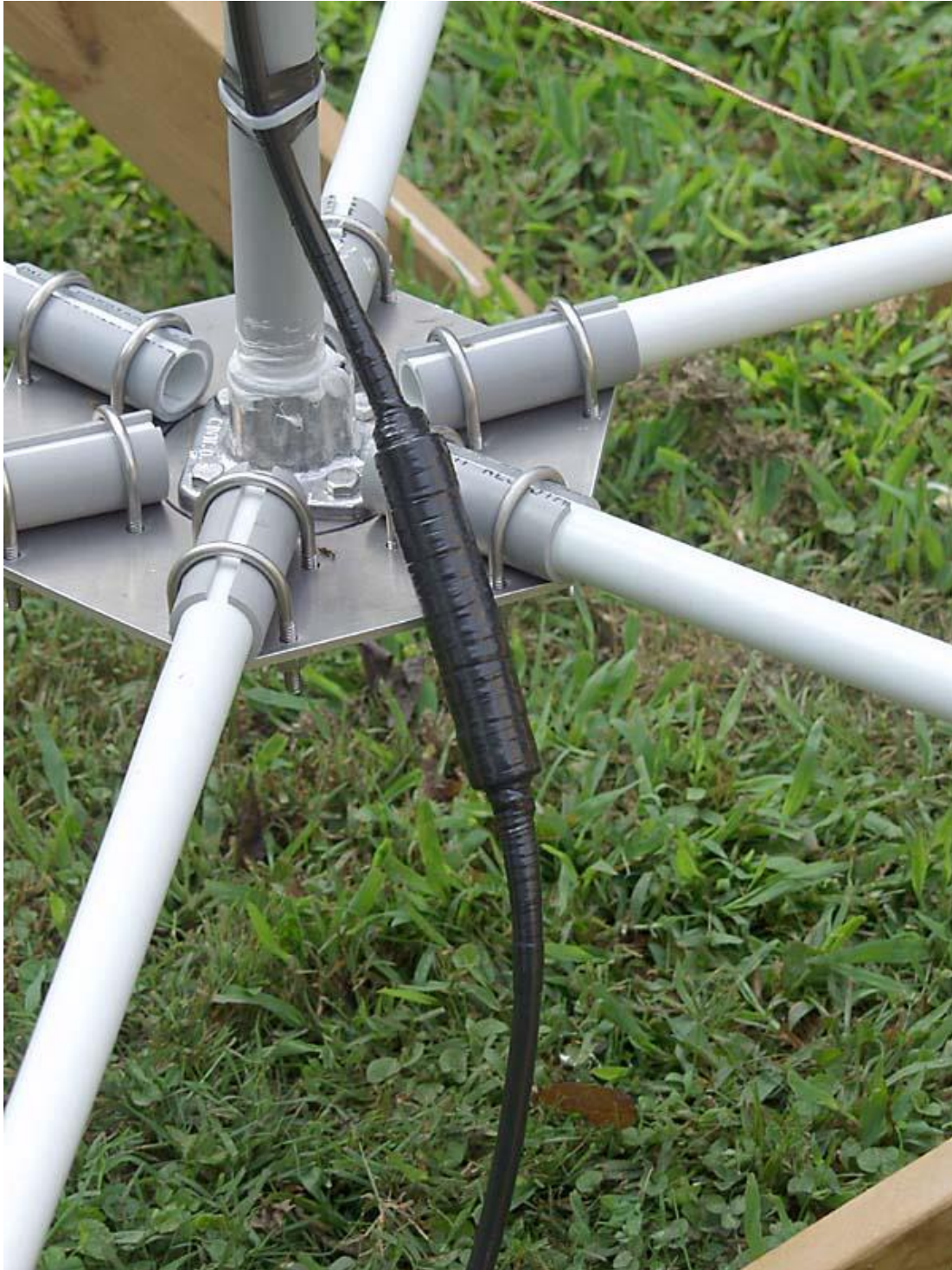
This is the Hex-Beam base. Everything attaches to that big hexagonal aluminum plate. The black blob on the RG-213 feedline is an RF choke, made from six Amidon FB-77-1024 Ferrite cores, wrapped up and weatherproofed.