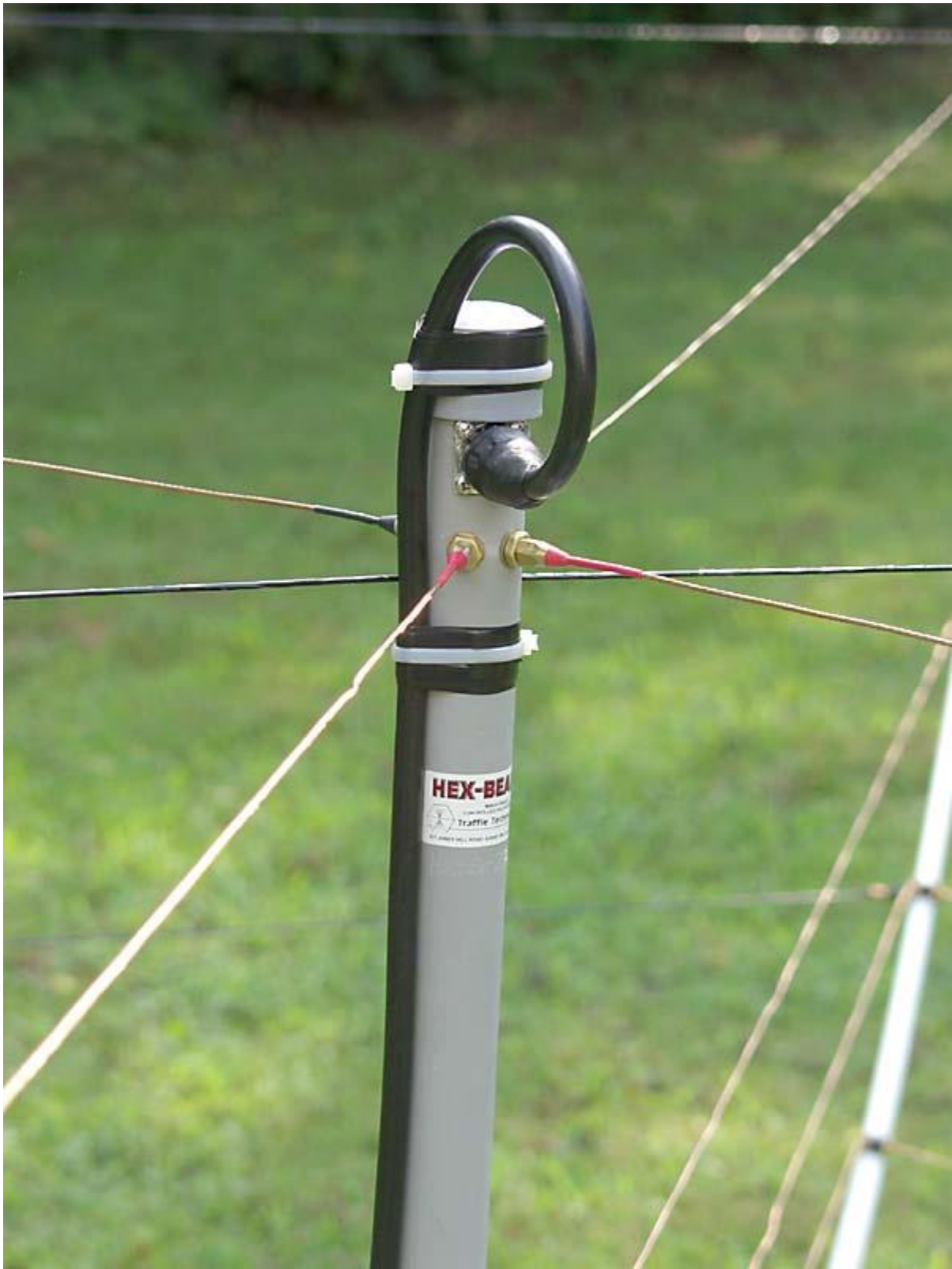
This is the feedpoint of the HX-B5i Hex-Beam. The red wires shown here are the 20 M driven element, and the black wires are the 20 M reflector.