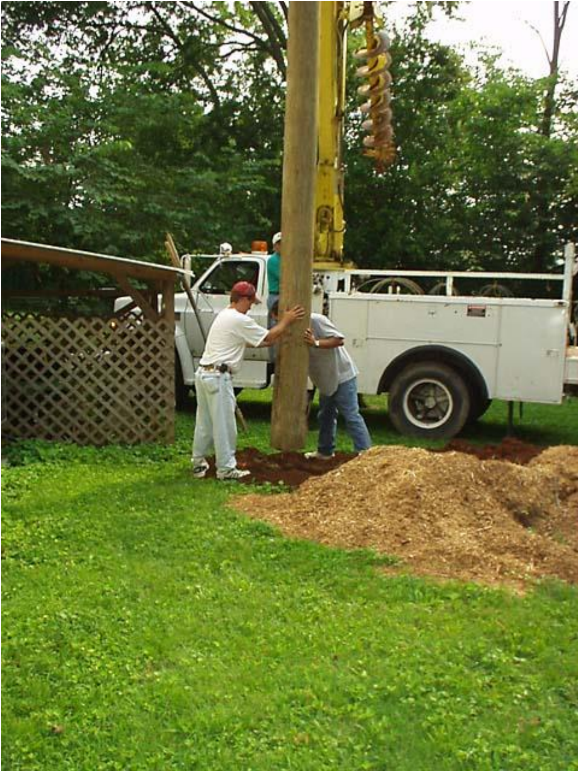
Now the base of the pole was brought above the hole.