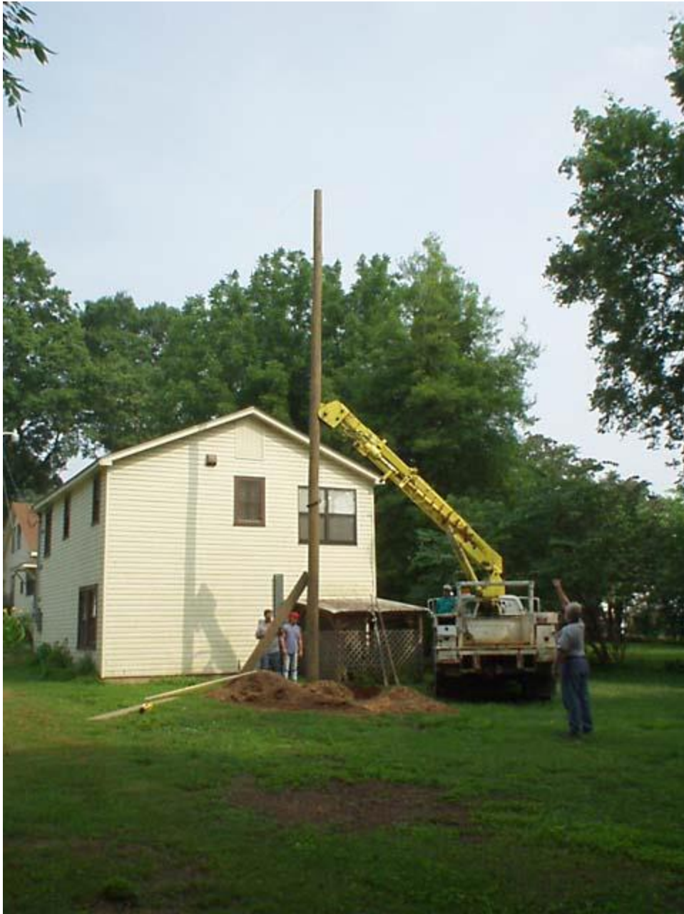
The plumb line was used to help get the pole straight.