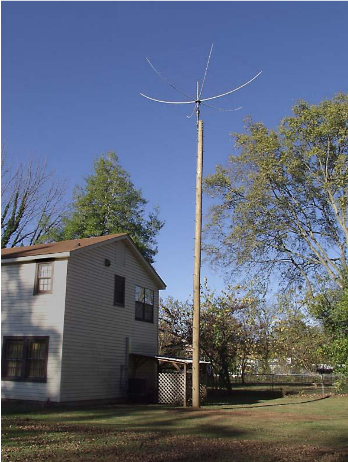
Finally, this is what the entire installation looks like from the ground. The height of the Hex-Beam is about 13 meters (41 ft.) and no guys are required. There is a 40 meter (135 ft) long flat top attached right below it.