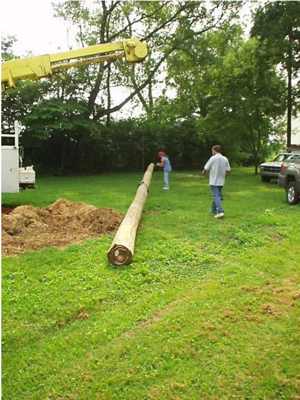
The ground wire (solid copper 4 AWG wire) was stapled onto the pole.