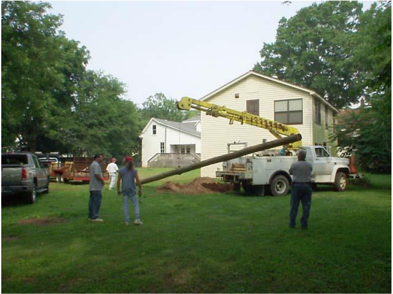
Next the crane was used to bring the pole into position.