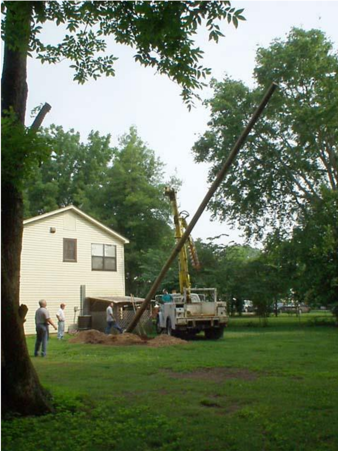
Everyone is standing well away from the pole. The crane operator said he had never dropped one - yet.