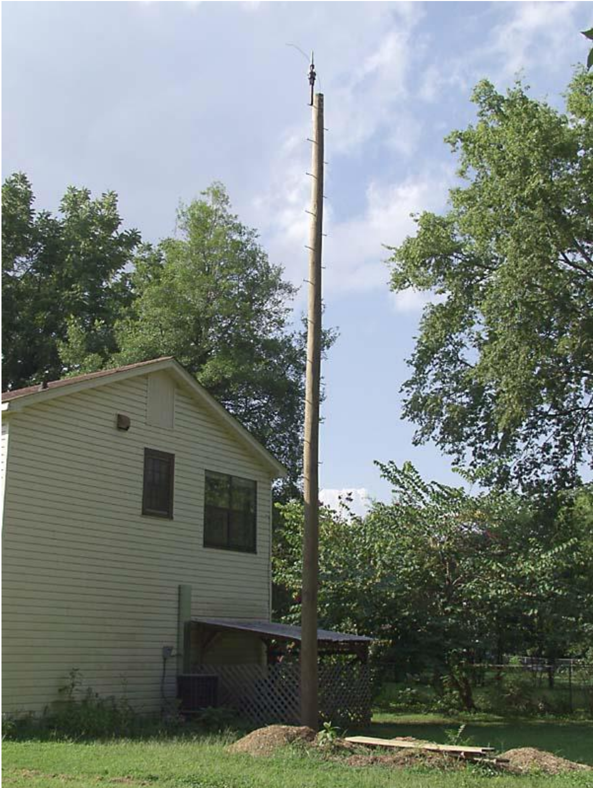
This is the over-all view of the pole with the rotator attached. The 39-foot high pole now has an additional 2 feet of bracket, rotator, and mast, for a total antenna height of 41 feet.